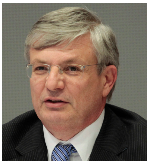
Tonio Borg EU Commissioner for Health

In 2013, RASFF proved instrumental for food safety authorities to trace back mislabelled beef products that contained horsemeat. Through the cross-border exchange of information, products adulterated with horsemeat were traced to source and swiftly removed from the market. With increasingly sophisticated food frauds affecting European consumers, we undertook to develop a dedicated food fraud IT