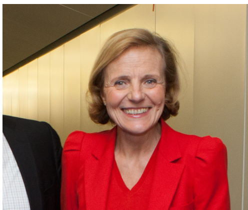
Paola Testori Coggi Director General for Health and Consumers

We have recently imposed stricter import conditions on citrus fruit (oranges, mandarins, grapefruits, lemons...) from South Africa and prevented imports of some fruits and vegetables, including mangoes from India, to address the risk of introducing foreign pests and diseases into the EU. This decision needed to be taken since a high number of consignments were being intercepted at EU borders with mainly insects such as fruit flies, not native to Europe and potentially