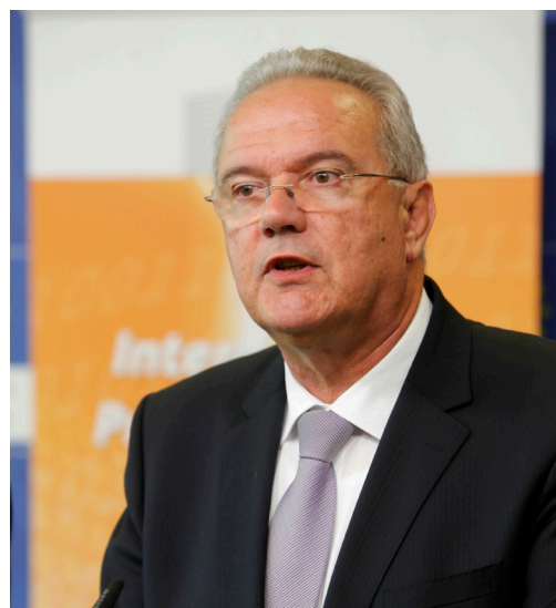
Neven Mimica EU Commissioner for Consumer Policy

As in previous years, goods markets have appeared to be performing much better than service markets, although the gap between both is narrowing. We have also welcomed an upturn of the previously worst performing markets, such as vehicle fuels and train services. Italy and the Czech Republic have, for example, seen their train services improve greatly, a fact that could be connected to the opening of their markets to competition. On the other hand, some sectors keep on scoring low, such as the banking services, the telecom market, the electricity and gas markets or the second-hand car market.