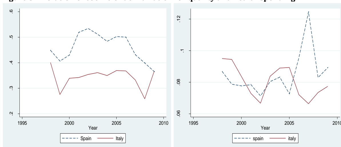
Figure 3. Evolution of coefficient of variation for quality and health spending

We also extend the analysis of the trends in inequality to two additional domains, namely fiscal capacity (proxied by per capita GDP) and needs (proxied by the share of people over 65 years of age). The lower panel of Table 2 shows these results. After decentralization, both countries experienced a decrease in inequality in fiscal capacities ( t -test significant at the 1% level in both countries), which was larger for Spanish regions; thus, convergence has been more rapid for Spanish regions in terms of per capita GDP. In contrast, we find two divergent patterns of inequality in needs, which increase in Italy and decrease in Spain: Italian regions are becoming more diverse in terms of needs, but this is not greatly reflected in the divergence of