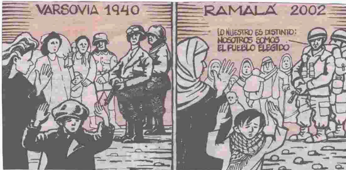
("Ours is different: we are the chosen people")

In May 2002, the Israeli government decided to build a wall or fence of separation, similar to the one that already existed in Gaza, whose efficacy in preventing terrorist attacks Israeli security reports had made clear. The first phase of the building began almost immediately. From the beginning, there was very detailed information on the construction and route of the fence, which penetrated into territories far from the Green Line, as well as about the negative consequences for the everyday life of Palestinians. In Spain, it was the CSCA that focused on this information, from reliable sources both Israeli ( B'tselem ) and Palestinian, most of them grouped in Pengon, the umbrella association of Palestinian NGOs. 43 The symmetry between images of World War II, the concentration camps and the wall/fence was implicitly or explicitly present in many of the popular mobilizations, in which information and protest merged. The Palestinians referred to similar images when they compared their situation to the Warsaw Ghetto, emphasizing the Jewish rebellion. 44