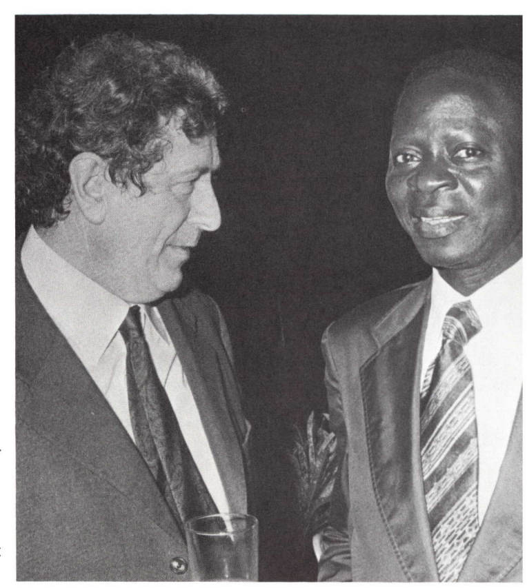
Irish Foreign Minister and EC Council President Garret FitzGerald (left) and Senegalese Finance and Economic Affairs Minister Babacar Ba, who led the developing countries' negotiators, during the February 28 signing of the Lomé Convention. "This precedentbreaking agreement assures these developing countries compensation when world prices for many of the products on which their export receipts heavily depend go below standard level."

Such accords are, and are likely to remain, total anathema to the free-market-minded Germans. The most they are considered likely to accept along these lines would be a very low floor price for a limited number of commodities involving financial supports but no stocks.