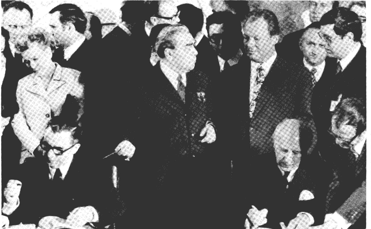
Détente: Soviet Communist Party Leader Leonid I. Brezhnev (left), standing beside then German Chancellor Willy Brandt (right), points to Soviet Foreign Minister Andrei Gromyko (sitting left) signing, along with then German Foreign Minister Walter Scheel (sitting right), the May 19, 1973, cultural cooperation agreement.

More seriously, it is notable that the European Community has begun to consider the condition of depressed regions. Where are those regions? Almost without exception they are to be found in the very places where half-submerged ethnic minorities reside—in Southern Italy, in Northwestern France, in the north and the west of the British Isles. If one were a diehard nationalist it would be a natural instinct not to give these wretches one sou,