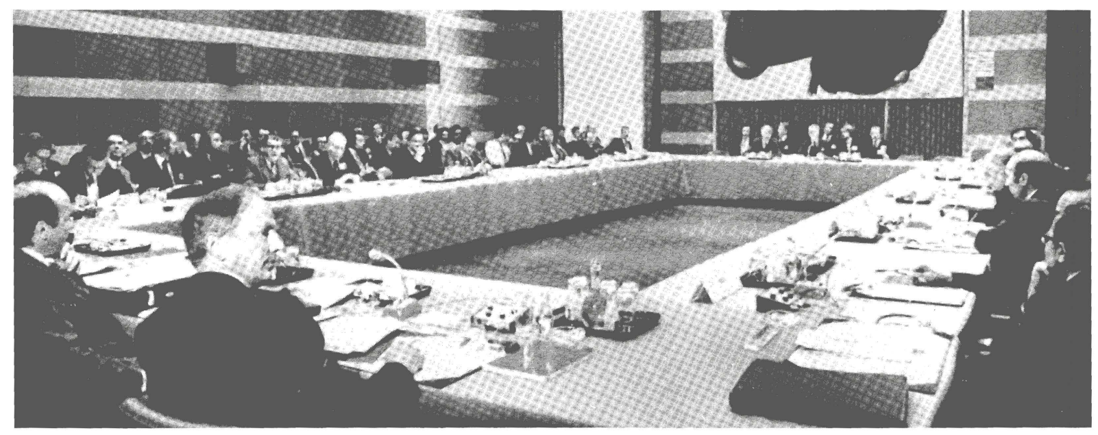
The Organization for Economic Cooperation and Development (OECD) energy committee meets at the Kleber Conference Center in Paris prior to the April oil producerconsumer conference, which "would open European eyes—and to a degree American ones—to the power inherent in Third World solidarity."

antee funds to encourage investment by private European industry in developing countries where investors normally hesitate to go because of fears of nationalization. The Commission also suggested decreasing the threat of such nationalization by helping developing country governments obtain stocks in European firms working within their borders.