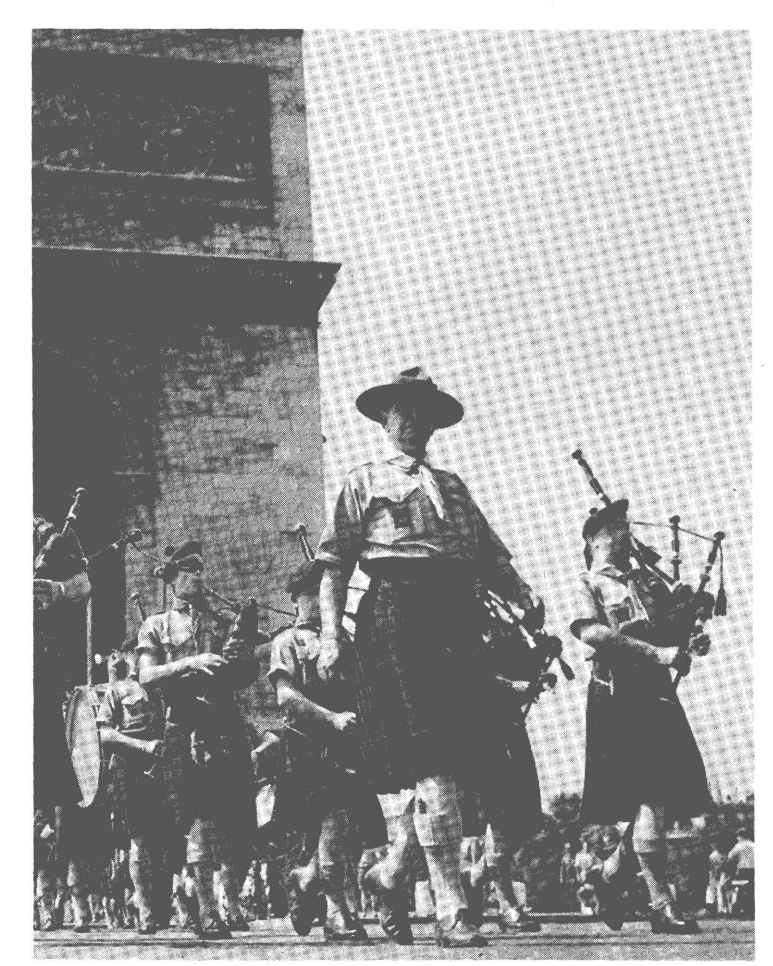
Scottish bagpipers marching in a Paris parade: "One could probably chart the rising curve of ethnicity alongside the rising curve of West European economic integration and find them virtually parallel."

pendence. It was seen again after 1963 when the Romanian communist leadership of Gheorghe Gheorghiu-Dej and later of Nicolae Ceausescu set and kept to a course of independence in foreign policy. Although still very annoyed about this, the Russians have demonstrated that they can live with it. It was also seen in the case of Finland, which has had to be very careful not to adopt policies deemed "anti-Soviet" in Moscow, but which has still managed to maintain a very considerable degree of independence in foreign policy and in trade and to conduct Finnish domestic affairs without notable interference.