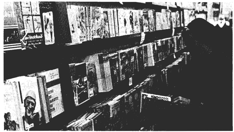
This German woman will be able to send up to $27 worth of books to her friends in other EC countries without paying the VAT in the recipient country, if a recent Commission proposal is adopted.

Intra-Community travelers will not have access to duty-free shops after December 31, 1973, if the Council approves a September 12 Commission proposal.