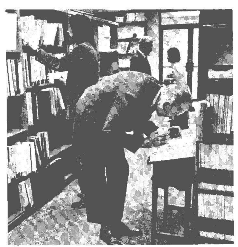
Librarians attending the conference sponsored by the European Community Information Service in Washington, DC, take a break from the seminar sessions to inspect the Service's library.

To help eliminate what some called a "librarian's nightmare," the EC Commission this year published a bibliographical catalog which will be made available upon request to libraries. Although most depository libraries and European documentation centers receive publications directly from the EC institutions in Brussels, the Washington Information Service and the branch office in New York City can often fill gaps in collections upon request. Out-of-print materials may be obtained on loan. In addition to providing stocks of basic documents, press releases, brochures, background notes, and a monthly magazine on Common Market affairs, the Information Service in Washington answers more than 600 inquiries each month on all aspects of the Community. The Information Service Library, which is open to the public, currently has about 17,000 titles. Librarians attending the conference were urged to refer the most difficult questions and requests for materials to the Washington office which also acts as