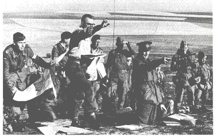
Officers of the NATO Ace Mobile Force during an exercise in eastern Turkey. This "Fire Brigade" force is made up of forces from Canada, Belgium, Germany, Italy, United Kingdom, and the United States.

The CESC is expected to be not one conference of foreign ministers but at least two. The first conference will elicit the various national policies on the agenda items and appoint a commission to study the agenda in detail and try to agree on a communiqué. A second conference of foreign ministers will then convene to issue the final communique and decide on a permanent consultative body.