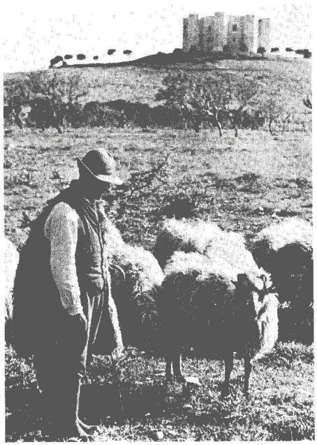
Agreement on agricultural trade policy is difficult because national farm programs encompass economic, social, and political considerations. An Italian shepherd surveys his flock.

A "Proliferation of Special Agreements" Some members pointed to what they saw as a "proliferation of special agreements" contrary to the spirit and inconsistent with the letter of the General Agreement on Tariffs and Trade (GATT). Some regarded as "simply preferential" negotiations "now going on in Europe, which are not aimed at the creation of complete customs unions, or complete free trade areas, but at establishing more or less general trade associations." The immediate effects of these agreements may harm the commercial interests of third countries. They criticized the Community's agreements with countries in the Mediterranean basin: "Their very number have the effect of transforming this area into a vast preferential market for the benefit of one major trading partner, the European Economic Community," the report said. These same members said the reverse preferences granted to the Com-