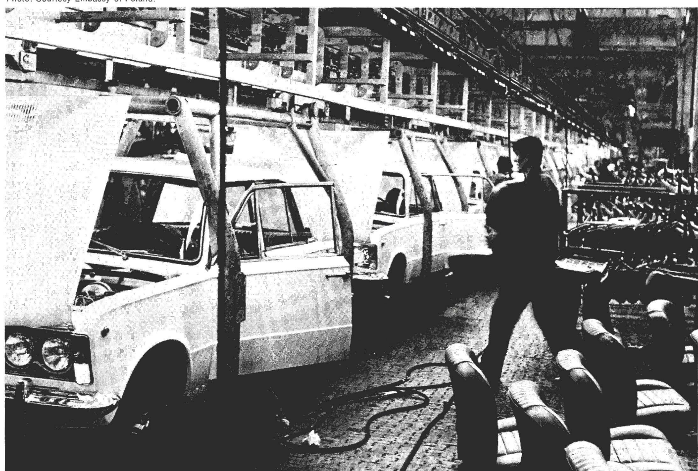
The new "Polski Fiat" symbolizes a major concession to long-denied home consumers and marks a new Polish quest for trade and economic cooperation with the West.

German Chancellor Willy Brandt suggested in a speech in Leverkusen on April 13, 1972, that a cooperative committee between the Community and Comecon countries be established to coordinate foreign economic policies. The Community countries would be represented by the Commission, while Comecon countries would be represented individually. The committee would concentrate on economic and commercial matters, enabling both regional groups to discuss and solve their trade problems without switching to a bloc-to-bloc policy. Such a flexible approach may represent the key to the complex problem of East-West trade development.