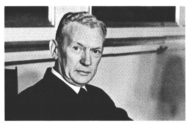
French Foreign Minister Maurice Couve de Murville

"Supranationality, in European jargon, is a very different notion. Essentially, it is to make it possible for decisions that concern a country to be taken by authorities other than the authorities of that country. Such is the case when this sort of decision can be the act of an international organization or of foreign governments. Such is the case, in other terms, as far as France is concerned, if we leave a verdict up to a Commission in Brussels or a majority of governments to which France is not a party. The serious question raised by the June 30 failure is whether such a situation is conceivable, and whether it is compatible with the normal management of France's affairs. . . .