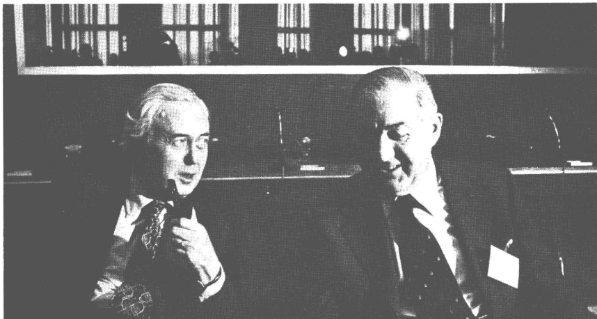
Mr Harold Wilson and Mr James Callaghan in Luxembourg for the European Council meeting on 1 and 2 April.

goalless draw. But this did not make the actual failure of the summit any less galling. It still took some believing.