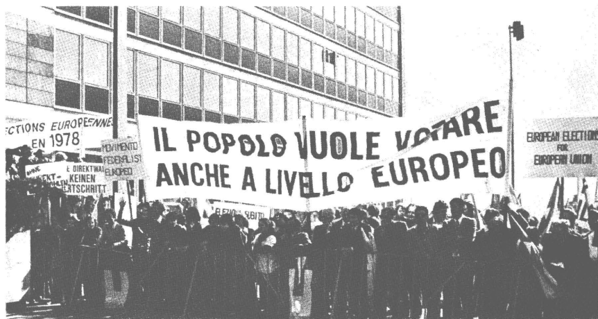
Demonstration in support of direct elections

It would be disingenuous to suggest that the European Parliament really expected the heads of state to take a final decision on direct elections here in Luxembourg on 1 and 2 April. Indeed, all the pointers were to a sort of political