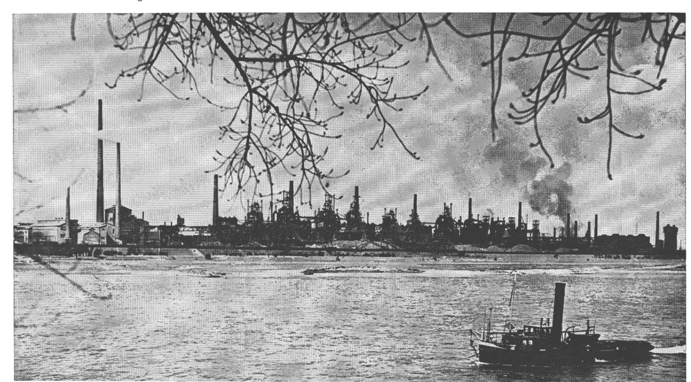
German Steel Mills Along the Rhine River

The levelling of transport tariffs, too, is felt to be a sacrifice. As a result of the standardization of "rate-of-fall" charges, French steel would, it is feared, gain a still firmer foothold in Southern Germany, but the same would not be true of German steel in France. The French, Belgian and Luxembourg industrial basin, they say, is planted midway between the Ruhr and France proper—the Ruhr is on the fringe of the common market. A correct balance could only be established by the reunification of Germany, when the Ruhr would regain its natural outlets eastwards. To offset the disadvantage of its peripheral position, it is argued, the Ruhr is obliged to defend the advantage it derives from its position close to the Rhine and Ruhr waterways.