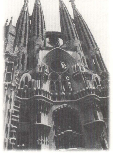
Barcelona: "Sagrada Família"

A dialogue between the different cultures of the Mediterranean region was urged and exchanges at human, scientific and technological levels so as to bring people closer and promote inter-cultural understanding. The media, education and training, cultural exchanges and language learning all had a role to play. "Social development must go hand