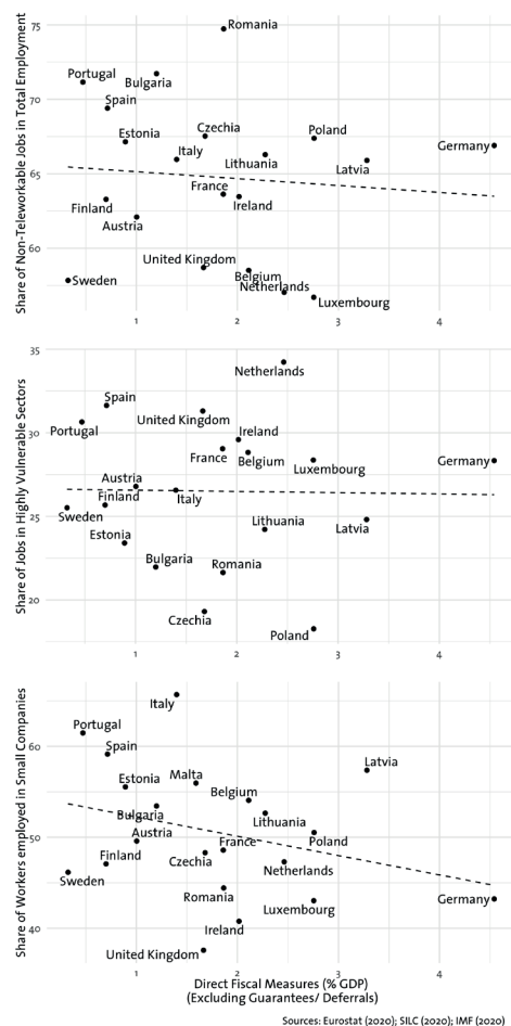
Figure 3: Economic vulnerabilities and early fiscal policy responses

When interpreting these numbers, we should keep in mind that for some measures it remains difficult to estimate a price tag upfront as, for example, the final costs of credit schemes or short-term working programmes will depend on uptake. Moreover, when it comes to liquidity support, countries differ when it comes to how private leverage is targeted via government cash. Nonetheless, observable differences in this initial data will matter down the road.