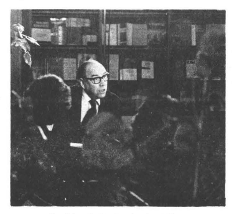
Jenkins in botanical setting

The January sitting of Parliament was remarkable, if for nothing else, for the vast numbers of journalists and other media men present. As Roy Jenkins rose to speak on Tuesday, the gangway behind the Communist Group looked like the Russian battery at Balaclava, in this case, with television cameras rather than guns (see p. 1). The press gallery was at one point verging on riot: quite apart from well over a hundred journalists trying to fit into some 35 seats, certain powers had allocated a large proportion of the places to members of the diplomatic corps. Fortunately, the latter didn't turn up (David Wood of 'The Times' has confessed to becoming, pro tem, the Ugandan ambassador).