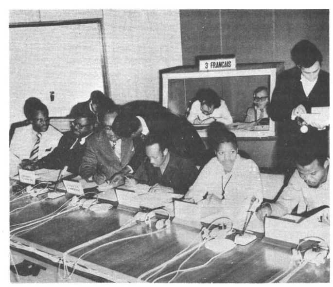
Lomé at work . . . . .

After expressing "satisfaction" with the application of the Lomé Convention provisions, they agreed on the need for the Stabex system of stabilising export earnings to be improved and enlarged; to improve information and consultation; to increase industrial cooperation; to take up the question of sugar price and storage in "a spirit of cooperation"; to seek extension of the special beef arrangements beyond 1977; to request implementation of the Lomé Convention banana protocol and to arrange for regular consultation with economic and social representatives to be coordinated with ILO meetings. The Committee also considered the effects of generalised preferences, regional and inter-regional cooperation, the situation in southern Africa, and how to improve on the "insufficient results" in UNCTAD.