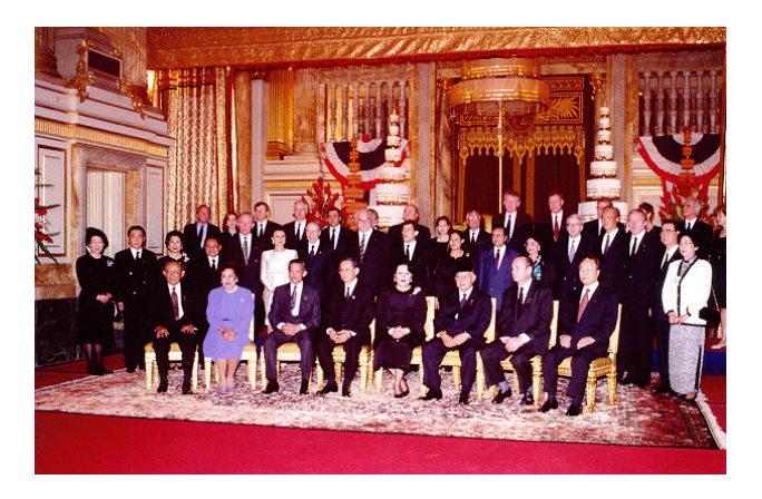
1st ASEM Summit, March 1996, Bangkok, Thailand

The initiative to establish ASEM came from Singapore in Autumn 1994, when then Prime Minister of Singapore, Goh Chok Tong first floated the idea of a summit-level dialogue to forge the link between the two regions in the tripolar economic world. The proposal to create an Asia-Europe forum for leaders to meet received the backing of ASEAN, and resonated in leading EU member states including France. After the European Council