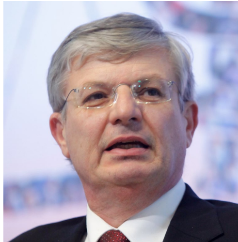
Tonio Borg EU Commissioner for Health

Since 2007, there have been warnings from European and global publications about alarmingly high mortalities in bees in the EU and beyond. This prompted the Commission and Member States to step up their monitoring surveys and take actions including the ban of specific pesticides (i.e. neonicotinoids). The findings of a landmark surveillance