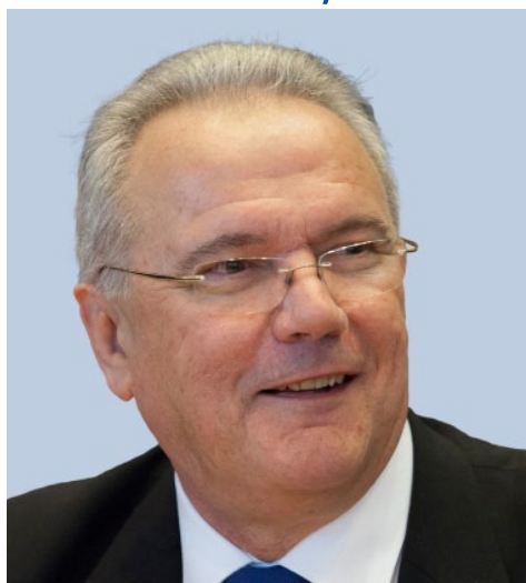
Neven Mimica EU Commissioner for Consumer Policy

EU Rapid Information system (RAPEX) is a ten-year old success story exemplifying the added value Europe brings. It is a story of countries working together for the safety of EU consumers, a collective effort of the national authorities and EU institutions serving European citizens. The 10th anniversary of RAPEX is testimony to the ever increasing importance