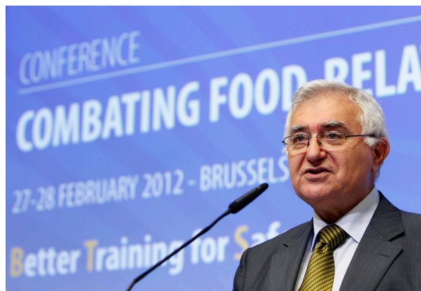
Food-related crime: EU Commissioner John Dalli described it as «one of the most important challenges»

A high-level EU conference on managing the growing challenge of food crime took place in Brussels on 27-28 February. It brought together policy makers, legal experts, police forces and food control authorities from across Europe.