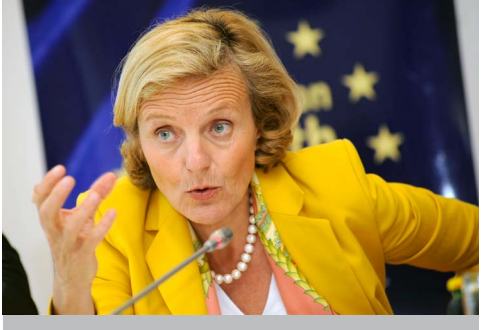
Paola Testori-Coggi, Director-General for Health & Consumers, at the Gastein Health Forum

«Informed patients are empowered patients,» was one of the European Commission's key messages at this vear's European Health Forum Gastein (EHFG). The event - held in October under the title, «Health in an age of austerity» - attracted over 600 decision-makers from 45 countries for a debate on the future of the European health care system.