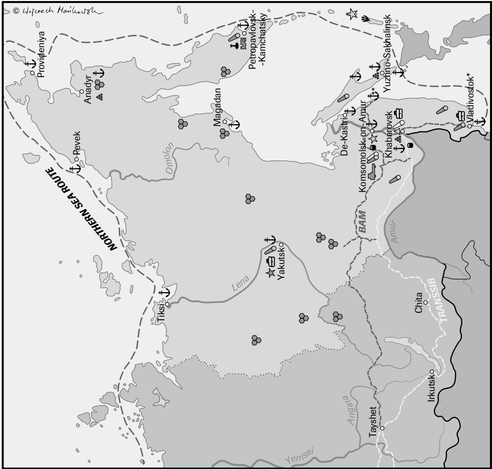
Map 1. Economic potential of the Far Eastern Federal District