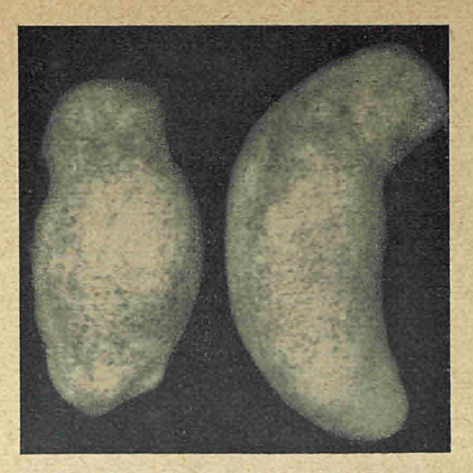
Fig. 1. Pleurodeles eggs cultivated for 4 days. Left, actinomycin D 10 \mu g/ml.; right, control

in the controls. The results of these experiments are practically identical with those obtained in this laboratory by de Vitry<sup>7</sup> when she treated Acetabularia halves with fluorodeoxyuridine. This analogue has now been found to inhibit strongly the transfer of nuclear RNA to the cytoplasm of the algae (de Vitry, unpublished). While the results of our experiments stand in agreement with the hypothesis stated here, the reasons for the unexpected inhibition of growth in the caps formed by the anucleate fragments in the presence of actinomycin remain to be studied.