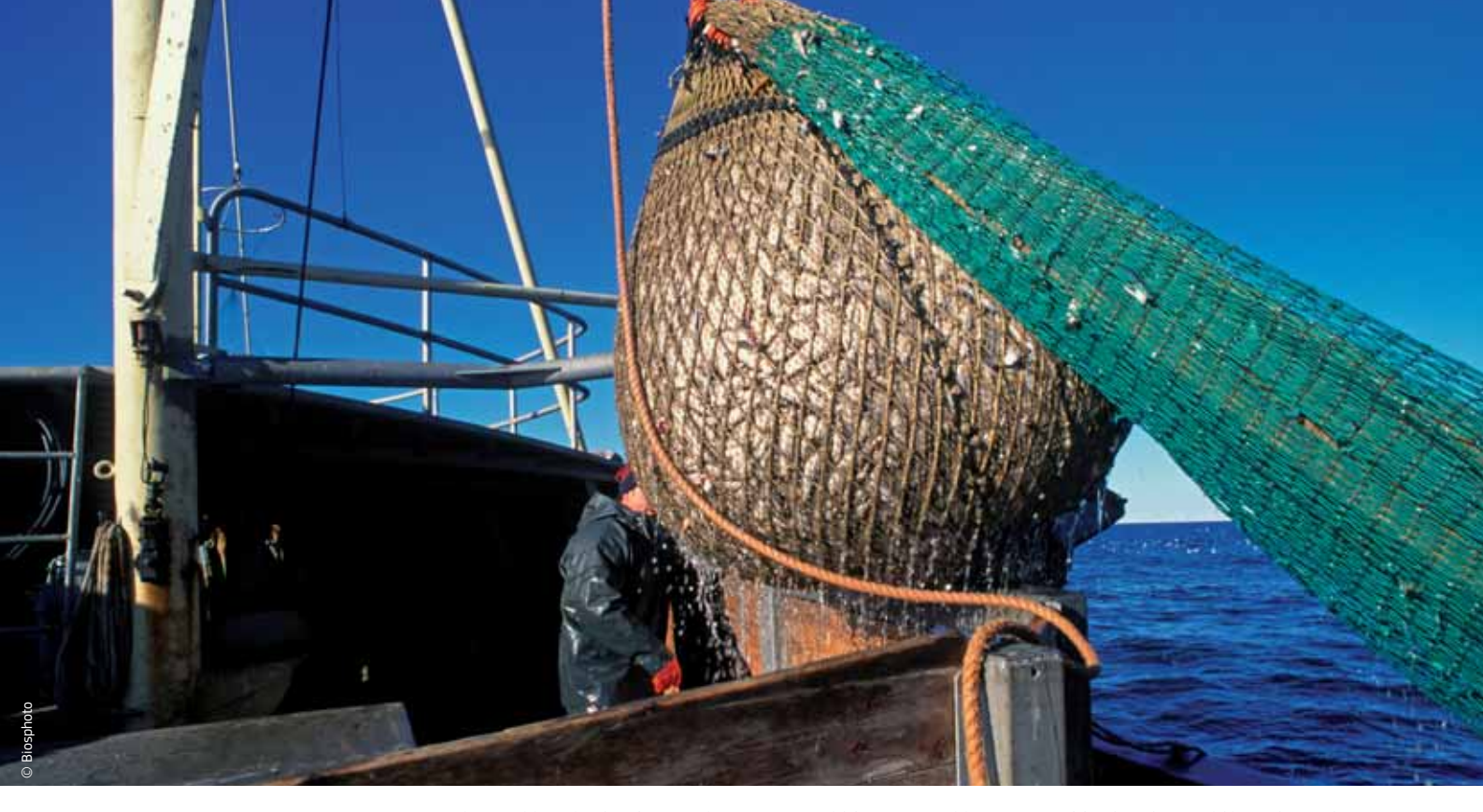
Halting public subsidies for vessel scrapping would free up sizeable amounts of funding that could be redirected towards the new objectives of the CFP, for example the development of more sustainable fishing techniques.