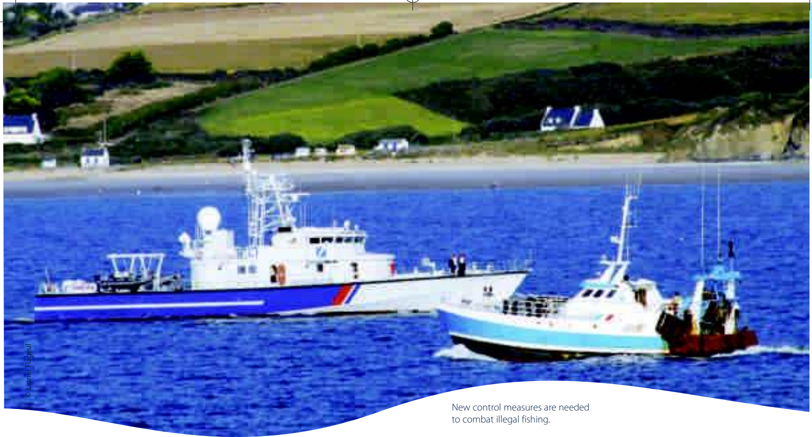
New control measures are needed to combat illegal fishing.

As a result, the Commission is proposing that all fishery products (including processed products) exported to the European Union must be certified by the flag state as having been caught legally. Proof of the legality of the catch must be provided by the flag state, and the port state may not authorise the entry of fishery products lacking such certification.