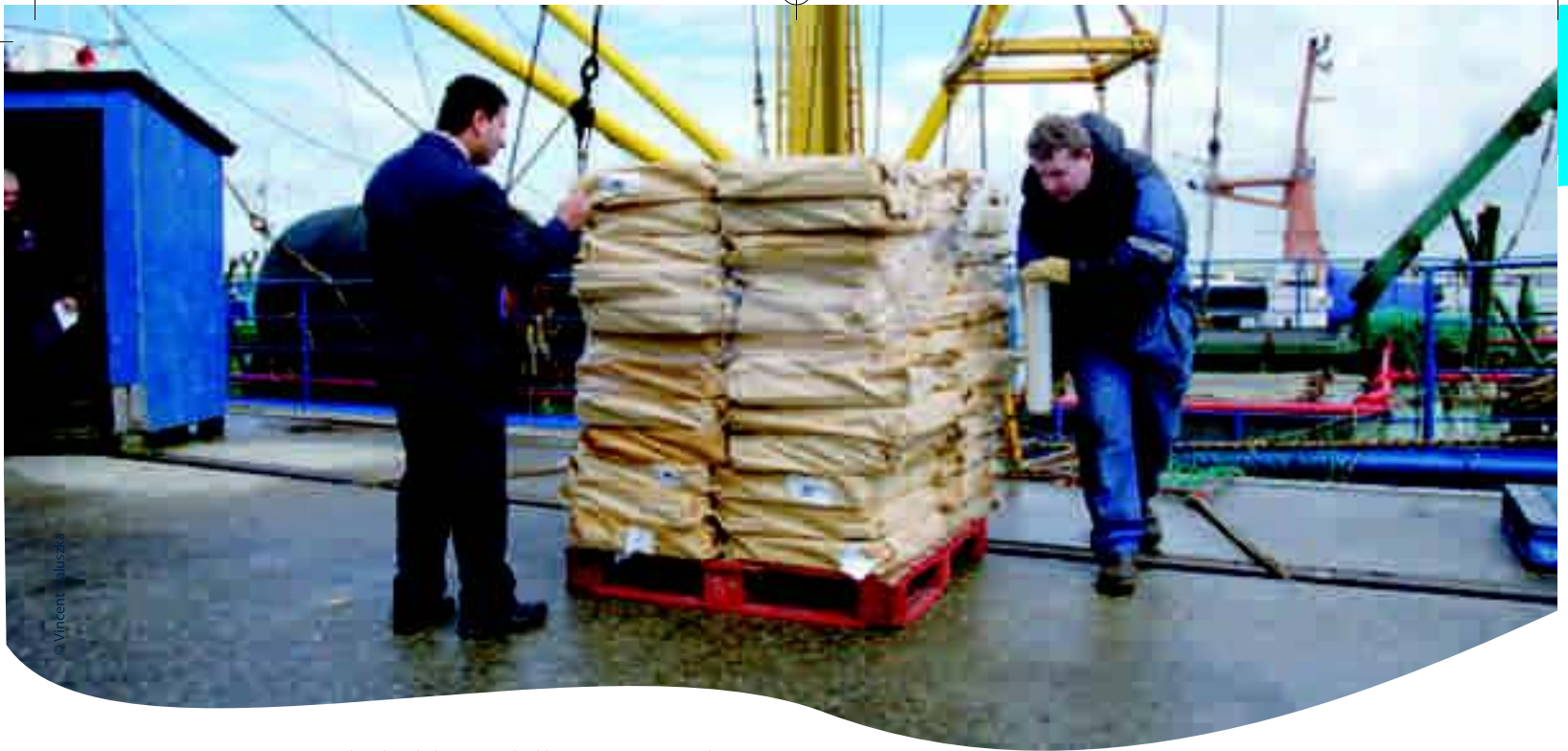
Port state control is already being applied by certain RFMOs, as here in Eemshaven, Netherlands, for landings of frozen fish from the NEAFC zone.

How do such controls actually work? To find out, Fishing and Aquaculture in Europe followed a cargo of frozen fish landed in Eemshaven. And while on location in the Netherlands, we also stopped off in Kerkrade, in Dutch Limburg, home to the nerve centre of the Algemeen Inspectiedienst (AID), the general inspectorate of the Agriculture and Fisheries Ministry.