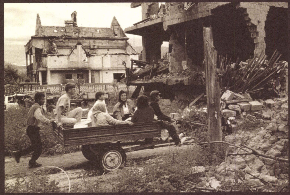
June 1999: Roma on the move in search of safety

ECHO is supporting an effort to ensure every family has one heated, winter-proof room