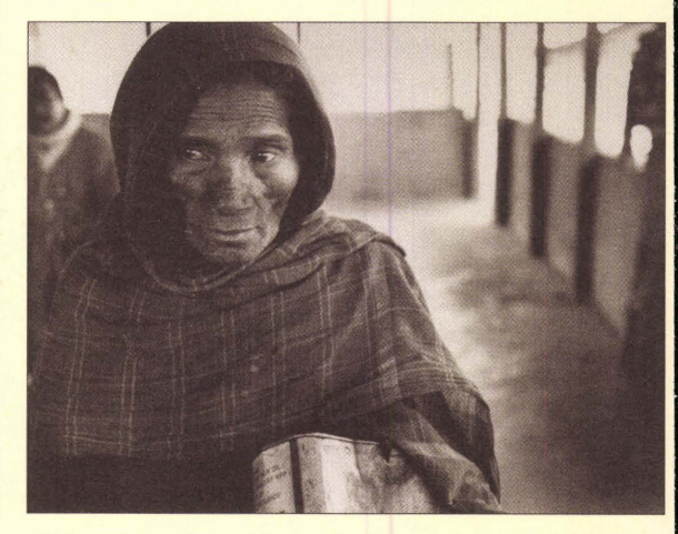
This refugee from Myanmar (Burma) is collecting food supplies for the family in a camp in Bangladesh

We went there with sleeping bags, water and food, but we gave everything to victims we met, except for the water. We were the first health team to reach Golcuk (district of Izmit, population 75 000). A team of 20 people from Ukraine had arrived just two hours after the earthquake. I don't understand how they got there, but I think it's time to start believing in God. I was supposed to be triage officer, but none of our plans worked. About 80 percent of the buildings had col-