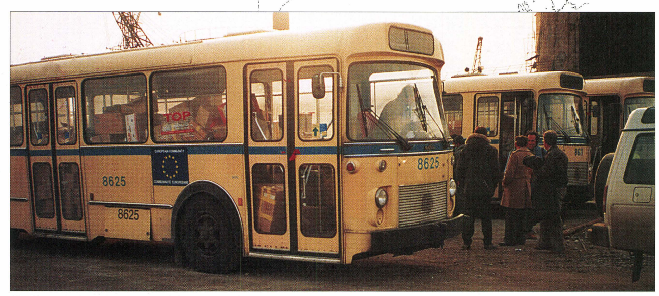
The Phare urban transport programme brings buses to Tirana