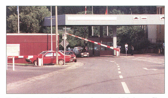
The Phare cross-border initiative strengthens regional links between Phare partners and their EU neighbours. Upgrading of roads and customs facilities are two key responsibilities.

The bulk of the projects up to ECU 130 million received firm financial commitment by July 1994.