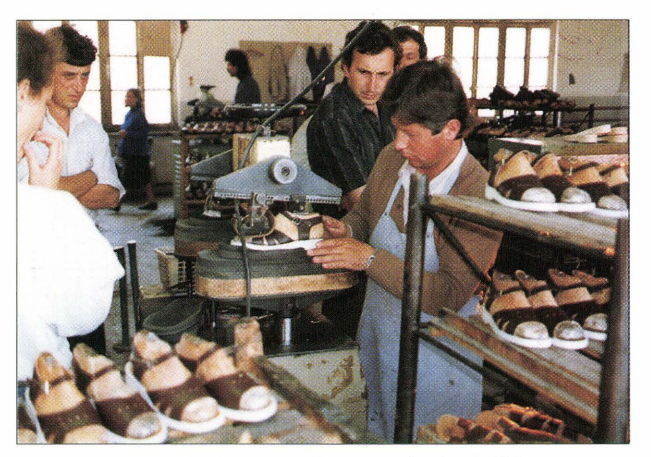
Phare is helping modernise many Albanian production facilities to create a vibrant private sector.

Business and financial know-how and support are being given to some 500 small and medium-sized agro-processing companies following their privatisation.