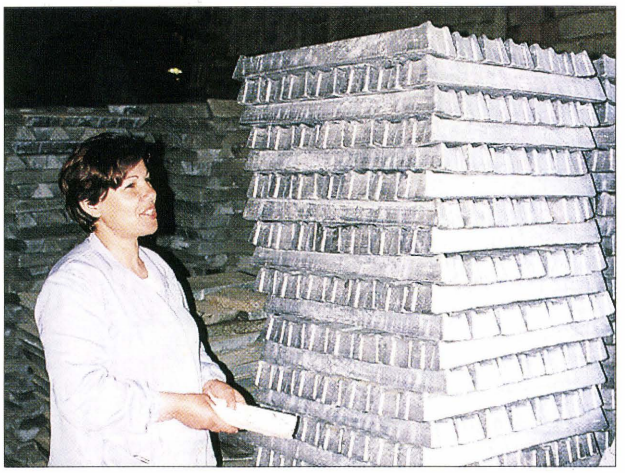
The mining of metals such as chromium and copper are one of Albania's economic strengths

Over the past four years, the Albanian government has progressed steadily away from a condition of severe economic, social and administrative dislocation, which was further complicated by substantial fiscal and external imbalances.