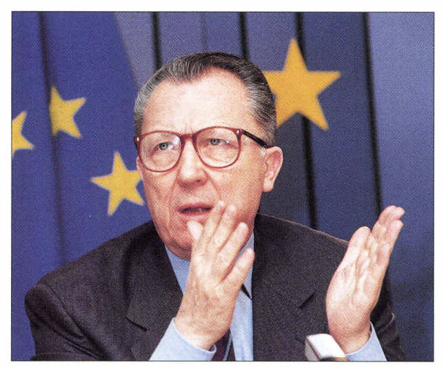
Jacques Delors: "...we are building an ever-closer European Union"

May 9, 1994 marked the 44th anniversary of Robert Schumann's declaration launching the European integration process. The occasion serves as a timely reminder that the project we now know as the European Union was, from the very outset, imbued with a political commitment to the common destiny shared by our peoples.