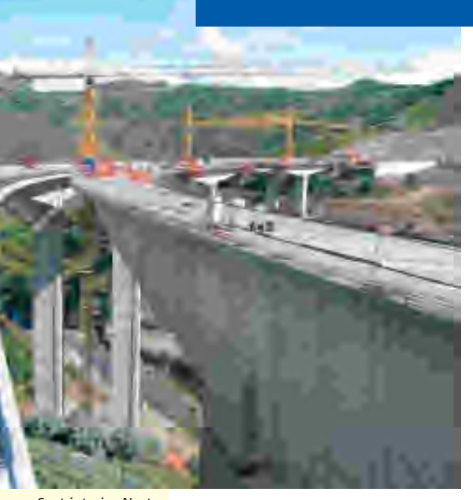
Scut interior Norte, Portugal

Development of public-private partnerships (PPPs) for projects that have traditionally been carried out by the public sector is part of the general trend towards privatisation, deregulation and market discipline, which has accelerated over the last two decades. Challenged by a growing demand for market-oriented, efficient and safe public services, and confronted with increasingly constrained public finance, many national governments have started to develop alternatives to the more traditional public procurement options.