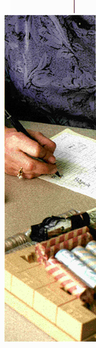
Information Programme for the European Citizen