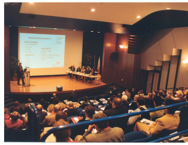
Hearing: tourism policy in the enlarged EU, Katowice.

Finally, on 19 November, the Polish organisers of the event presented their conclusions with regard to the benchmarking of the tourism sector in Katowice and Crakow.