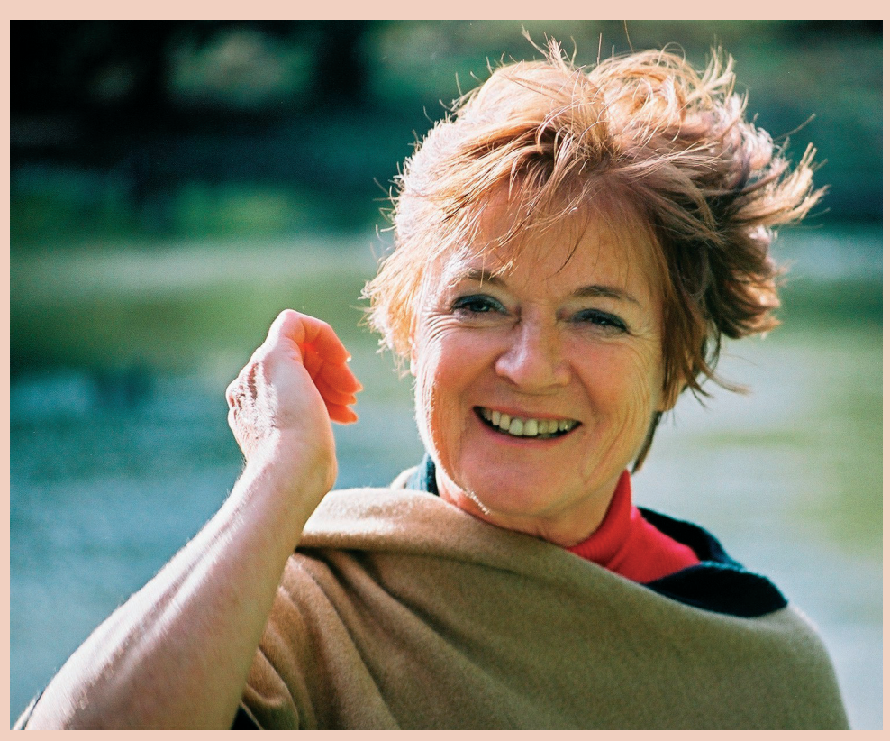
PRESIDENCY The EESC Presidency comprises one president and

two vice-presidents with a two-year term of office.