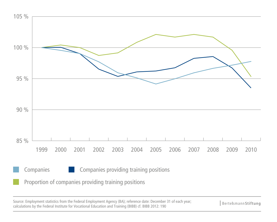
Figure 3: Trends in company participation in training 1999–2010

The rate at which companies hire young people as they transition from training to employment sheds light on the extent to which vocational training serves as an investment in recruiting skilled workers. The higher that rate is, the more effective the investment. However, it is important to remember that there may be many reasons why trainees are not hired: perhaps the company had no intention of hiring in the first place, for example, or it was planning to hire only a few trainees. Trainees themselves, for their part, may make a conscious decision to pursue another career path or further schooling (enrolling in a university, for example).