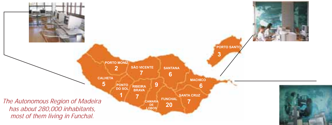
Figure 2: Implementing the Lisbon strategy in the Region of Madeira (Caires Raul, Region of Madeira)

The project intends to create 80 spaces, around the Region, fully equipped with multimedia computers, printers and Internet access. These places will be situated in public areas so that they might be accessible to all.