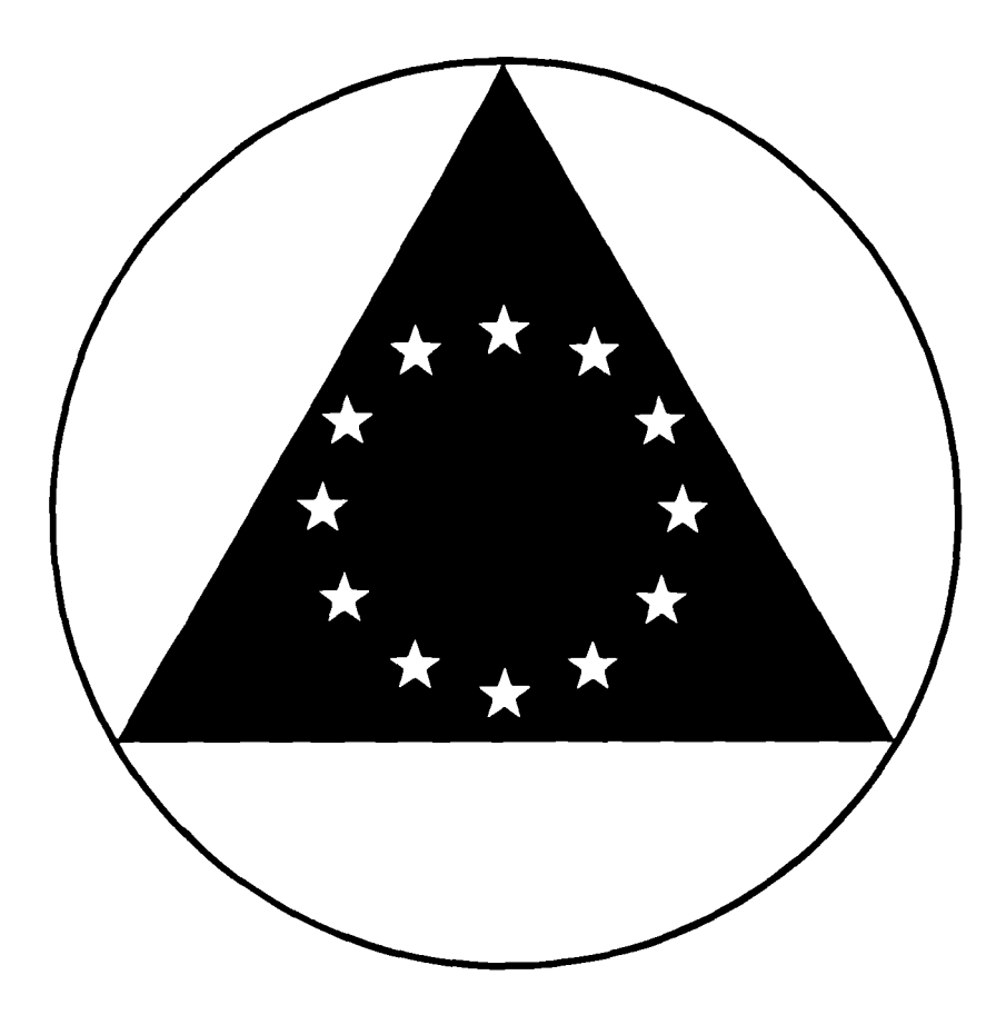
Proposed European civil protection logo