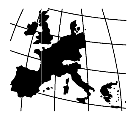
No. 47, Autumn 1994

The "Policies" bulletin is compiled on the basis of information provided by national correspondents. It is published in English, French and German.