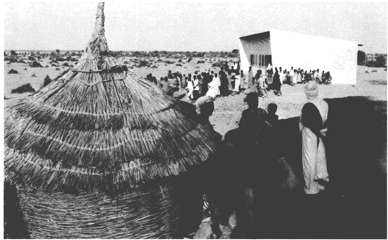
Aid to education: African children gather outside one of 46 primary schools being built in Mauritania with European Development Mauritania's illiteracy rate is currently 92.7 per cent.