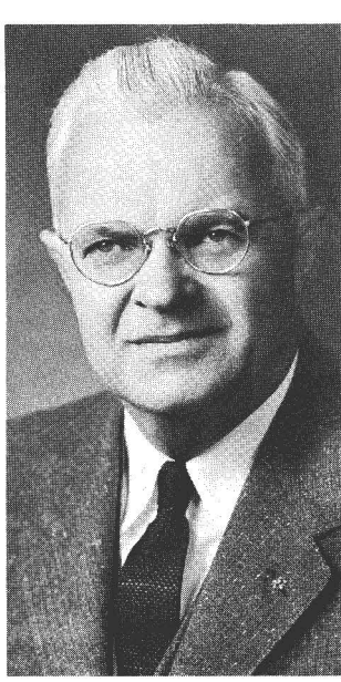
Herschel Newsom National Grange Master and IFAP President

"European producers believe that there is a strong case for a progressive expansion of European production in many sectors, a necessary condition for the indispensable improvement of their incomes. They stress, in particular, that European agricultural production which is intensive in character obtains very high average yields; that economic, technical, social, and political imperatives result from the high density of population in European countries; and that agricultural trade between European and North American countries is strongly unbalanced to the advantage of the latter."