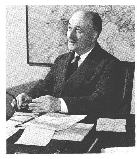
ean Monnet, President, tion Committee for the Inited States of Europe

The declaration also stressed the development of peaceful coexistence between the West and the Soviet Union through successive agreements and the reunification of Germany in the European Community.