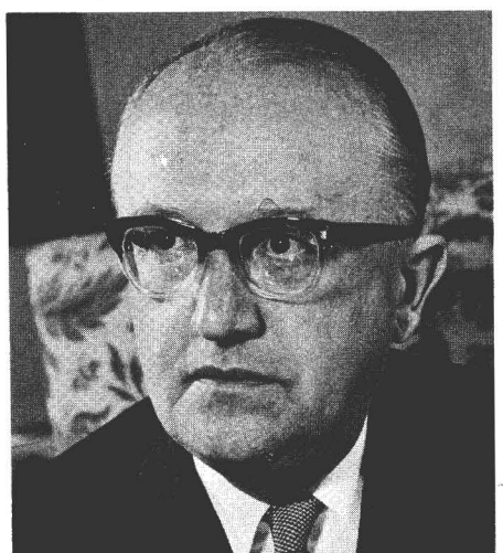
Walter Hallstein President, EEC Commission

EEC Commission President Walter Hallstein addressed a letter, on June 4, to each of the foreign ministers of the EEC member governments, urging strongly that the Six reconsider their decision postponing agreement on the common Community cereal price. The Commission letter declared that the postponement "jeopardizes the whole Kennedy Round."