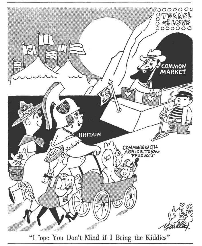
YARDLEY—The Baltimore Sun

Other developments concerning British entry into the Common Market included Labor Party leader Hugh Gaitskell's statement opposing the provisional terms reached in negotiations and Prime Minister Harold Macmillan's efforts to rally public opinion to support the Government's efforts on the eve of the Conservative Party conference at Llandudno, Wales, on October 10.