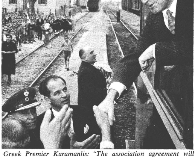
Greek Premier Karamanlis: "The association agreement will protect the Greek [economic] efforts, while at the same time creating the conditions for a rapid modernization of the countrys' economy."

A joint Council of Association will be formed, composed of members of the Greek Government and of the Community's Commission and Council of Ministers. Any