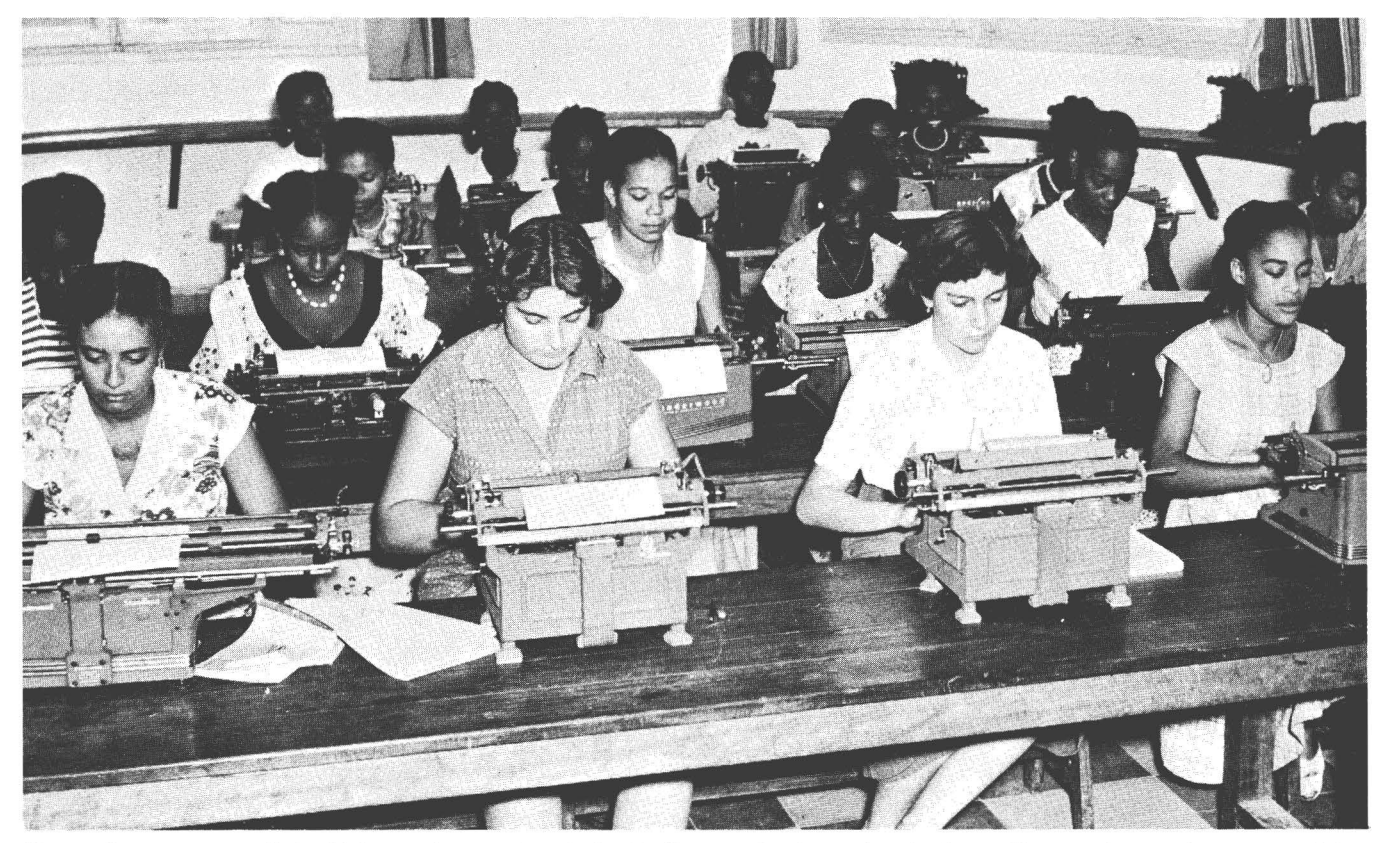
Economic programs will be high on the agenda of the Parliamentarians' meeting in June. Here student typists are receiving vocational training in Senegal.