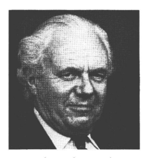
Lord Bessborough (British, EC)