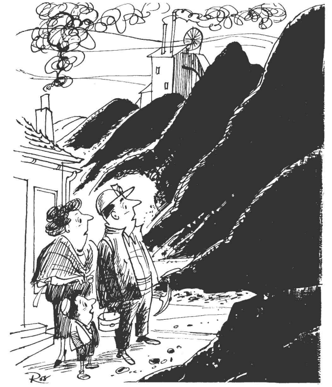
Government officials aren't the only persons worried about the coal surplus.