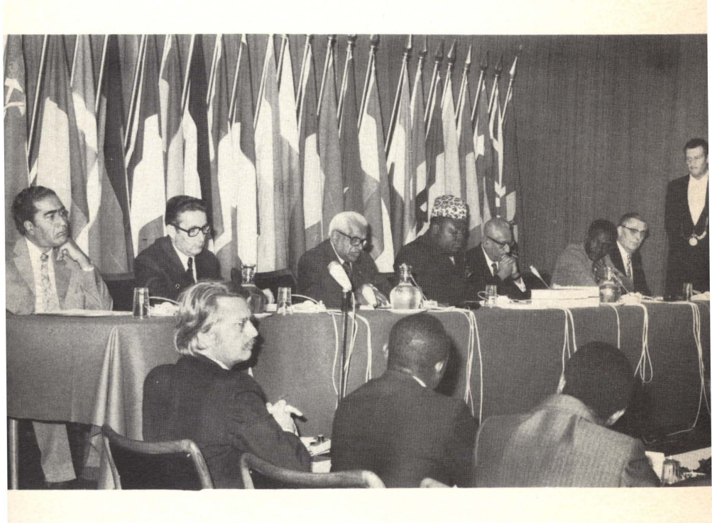
The Joint Committee of the African Association meets in Mauritius

The parliamentarians issued a second statement concerning Botswana, Lesotho and Swaziland. Their hope is that these countries will enjoy a greater measure of economic independence when negotiations are completed. The African Association must remain open to countries like these that have regained or are about to regain their independence.