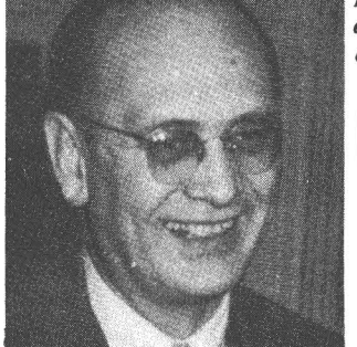
economist, and Vice-President of the High Authority.