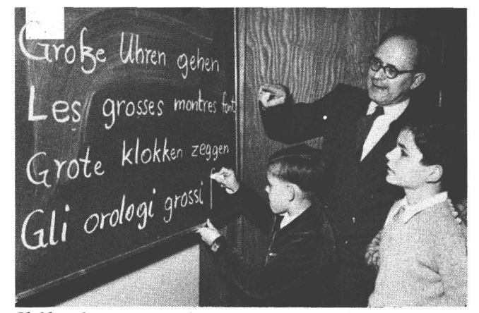
Children learn songs in four languages at the European Primary School in Luxembourg run by the High Authority