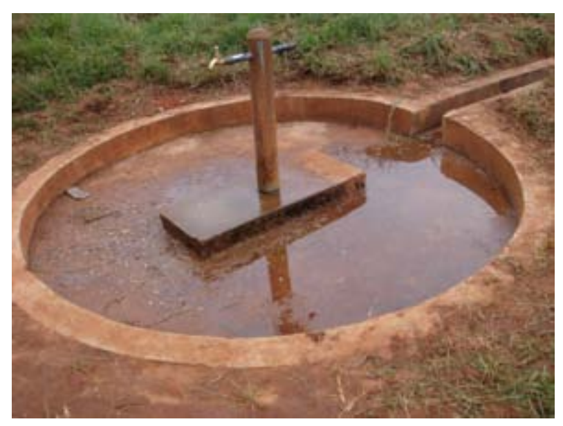
Standpipe in a school in Kilolo - Tanzania

17. The Court's visits and analyses of reports showed that appropriate equipment for water supply had been installed for all the projects. In some cases the original plans were adjusted in terms of quantity, technical specifications, location and timing in order to meet the local conditions encountered during implementation (see Annex IV and Box 2 ).