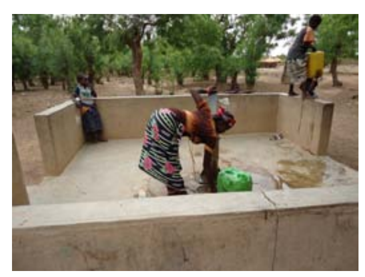
Standpipe - Burkina Faso

Overall the projects audited promoted the use of standard technology and locally available materials for both water-supply and sanitation components. Particularly in the case of rural projects (15 of the 23 projects), they built easy-to-maintain boreholes, dug wells equipped with hand pumps for water supply and promoted the construction of low-cost toilet models using locally available materials.