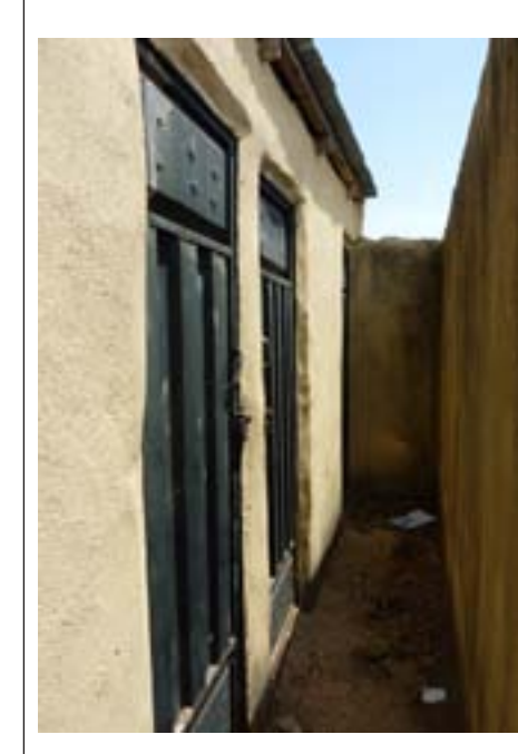
Small Towns Water Supply and Sanitation Programme - Nigeria