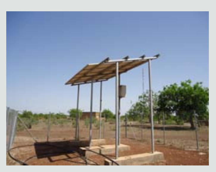
Regional solar programme - Burkina Faso

However the results of the activities undertaken in the area of hygiene promotion in schools and in the community were found to be largely ineffective (2009 second performance monitoring report and 2010 ROM report).