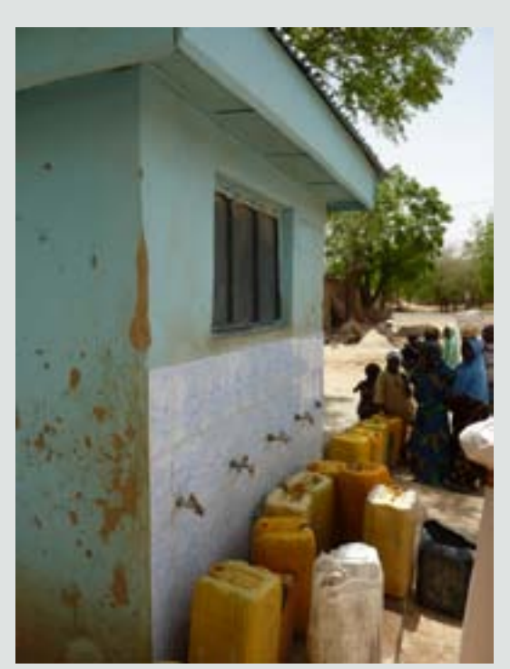
Water kiosk, Jigawa - Nigeria

The project did more than provide infrastructure. By helping local communities identify for themselves what they needed from the project, it aimed to make long-lasting changes in behaviour. Water consumer associations participated in the discussions on the technical specifications of the water-supply and sanitation systems, taking into account the needs of the customers, and were in charge of the day-to-day operation of the systems. They received support from the water and sanitation state agency when maintenance and repairs were needed.