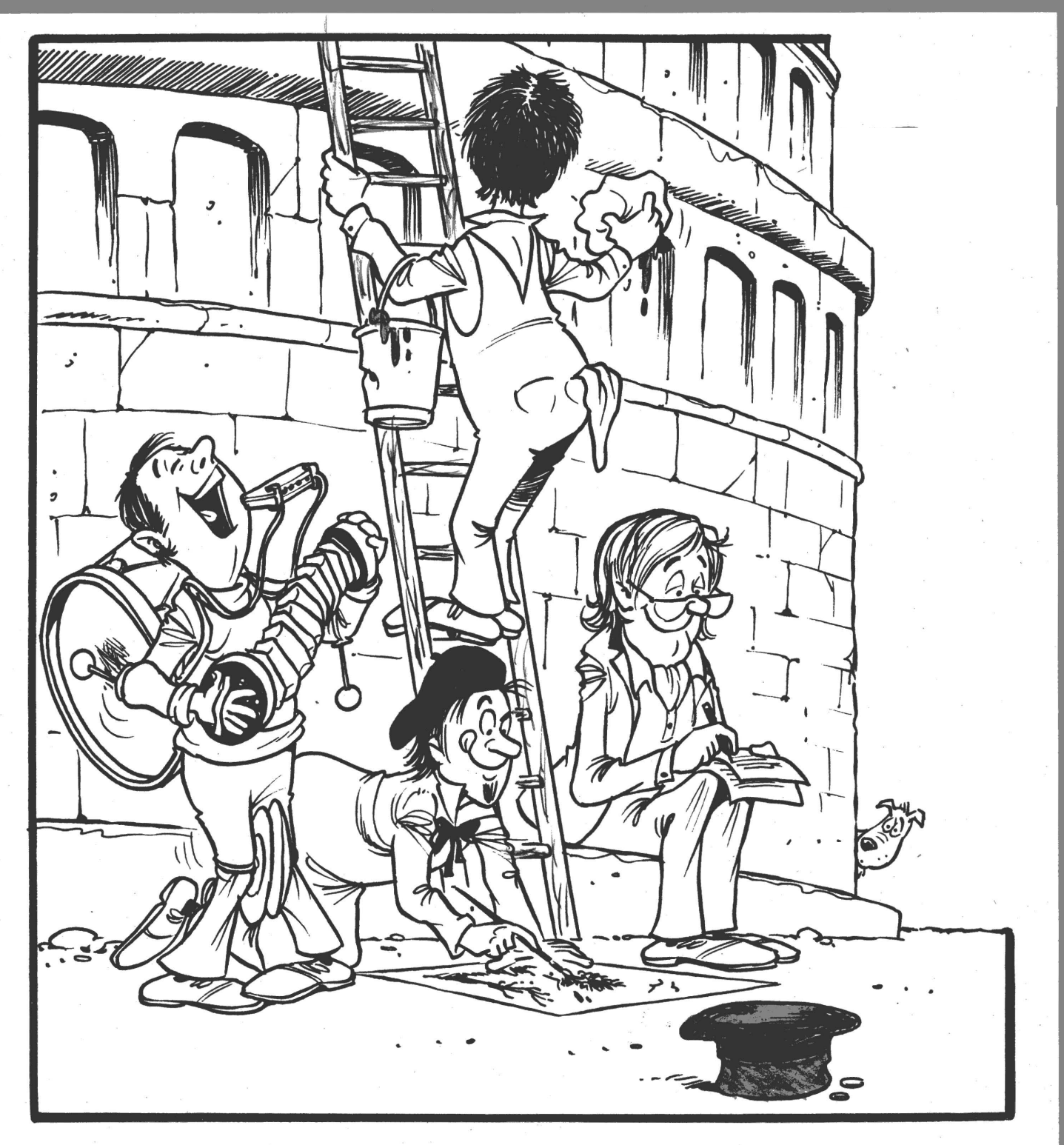
A developing role for the Community. See page 3.