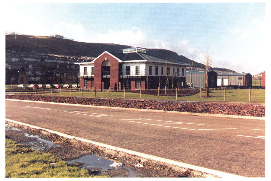
Cwm Cynon Business Centre, Aberdare.

An important innovation introduced by the Reform of the Structural Funds in 1988 were 'Community Initiatives' which enabled the Commission, on its own initiative, to create specific structural policy measures with a Community dimension. 13 such measures were announced by the Commission, and Wales benefitted directly from 6 of them: