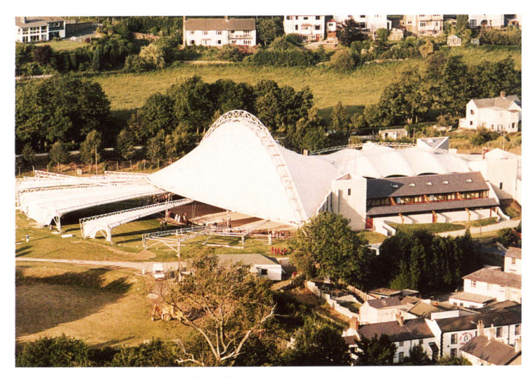
The Royal International Pavilion at Llangollen.

This brochure is also available in Welsh.