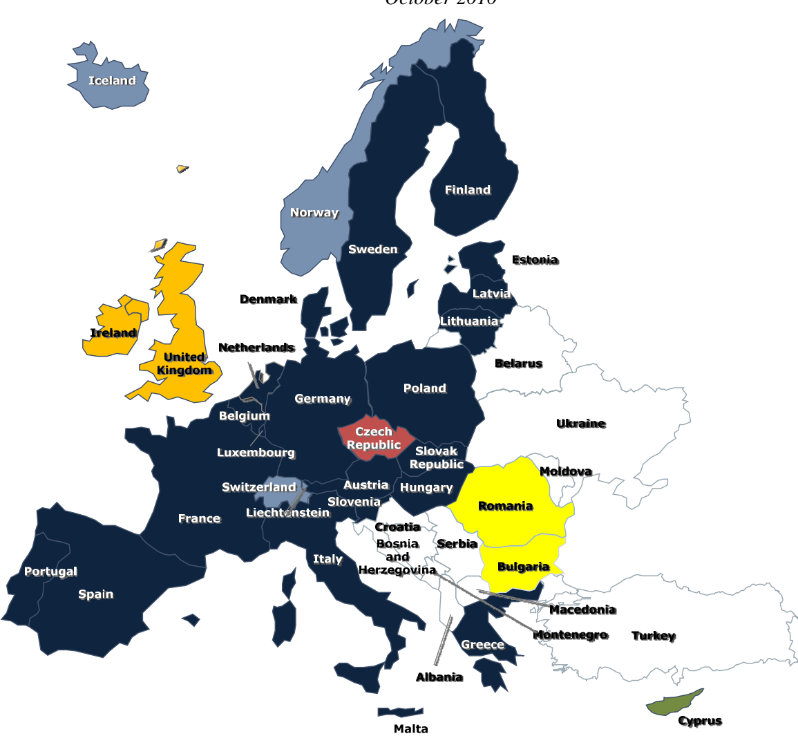
Figure 4. Exceptions to the principle of visa reciprocity between Canada and the EU, October 2010