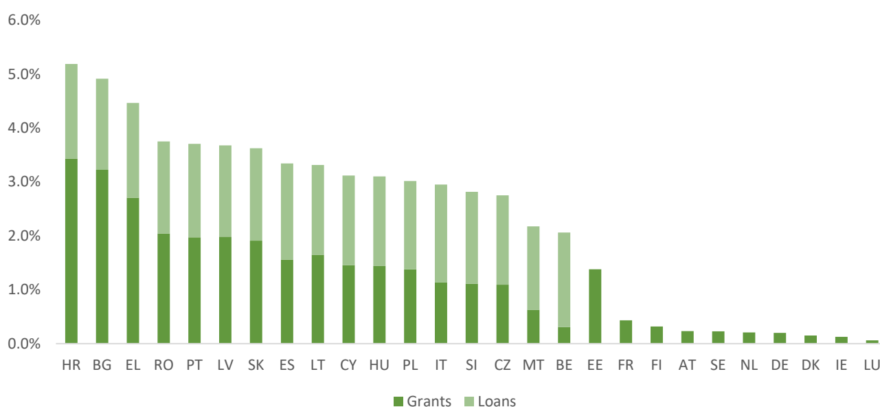
Figure 1. Annualised NGEU loans and grants support per member state (% GDP 2021)

2