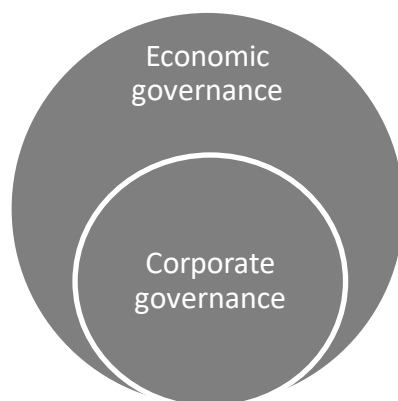
Figure 1: Stylised governance model

This paper examines how governments and companies can be jointly empowered to have a positive impact in terms of achieving the SDGs. The current economic system, which is largely geared towards maximising economic growth, might hold companies back in their attempts to balance profit and impact. For business to be purpose driven, broader change of the governance of the economic system (including institutions with long-term orientations) is necessary. The central premise of this paper is that the choice of governance for the economy and for the corporate sector cannot be studied in isolation (Figure 1). Corporate governance must fit within the broader economic system to be successful. This paper investigates the link between economic and corporate governance.