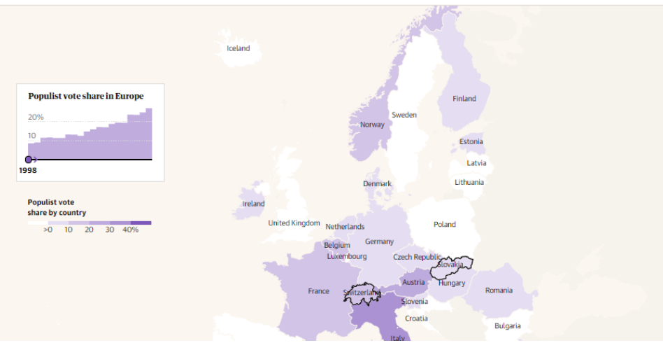
Figure 1 Populist vote share in Europe in 1998

Over the last two decades, Europe has seen the rise in popularity of populist parties, particularly on the right of the political spectrum. According to a report carried by The Guardian, populist parties accounted for roughly 7% of votes <u>across Europe in 1998</u>. However, recent national elections in several European countries show over 25% of votes were for a populist party. As at 2018, 11 European countries have populist parties holding a share in national government. <u>The total European population that is ruled by a government with at least one populist member in cabinet has increased from 12.5 million to 170 million</u>.